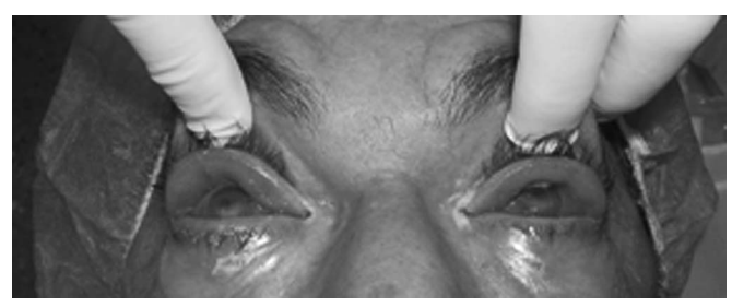
FIGURE 2. Preoperative appearance. Marked laxity and ready eversion of upper eyelids.

Topical anesthesia has an adverse effect on corneal epithelial microvilli and corneal epithelial cell migration and on keratocytes and corneal endothelial cells. The clinical picture of topical anesthetic abuse includes persistent corneal epithelial defects, stromal edema, corneal thinning, and even corneal perforation. When the eye is in such a "hot" condition, diffuse erythema and edema of the conjunctiva and eyelids are to be expected, thus concealing the underlying and primary cause for such abuse. In our case, after initial clinical improvement, we discovered the floppy state of the eyelids. Presumably, this was the underlying undiagnosed cause of the patient's ocular irritation, which led him to seek treatments before admission to our hospital. Delay in diagnosis is not uncommon in FES; however, in this patient, it led him to topical anesthetic abuse.